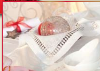
Art. 4386016 Coton à Broder #16