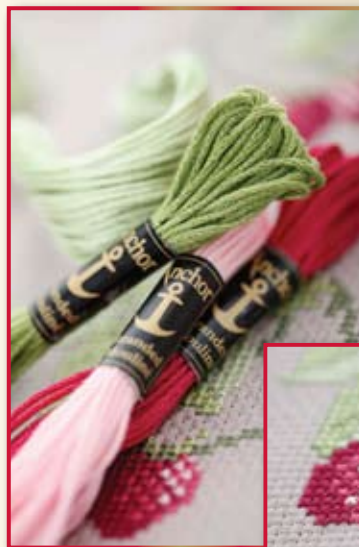
Art. 4635000 Stranded Cotton 8m, 460 shades