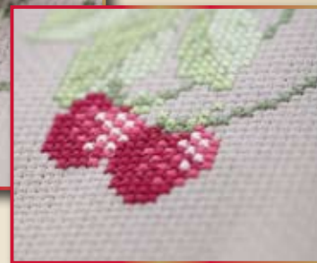
Art. 4615000 Stranded Cotton Multicolour 8m, 24 shades