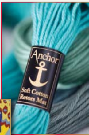
Art. 4335000 Soft Embroidery